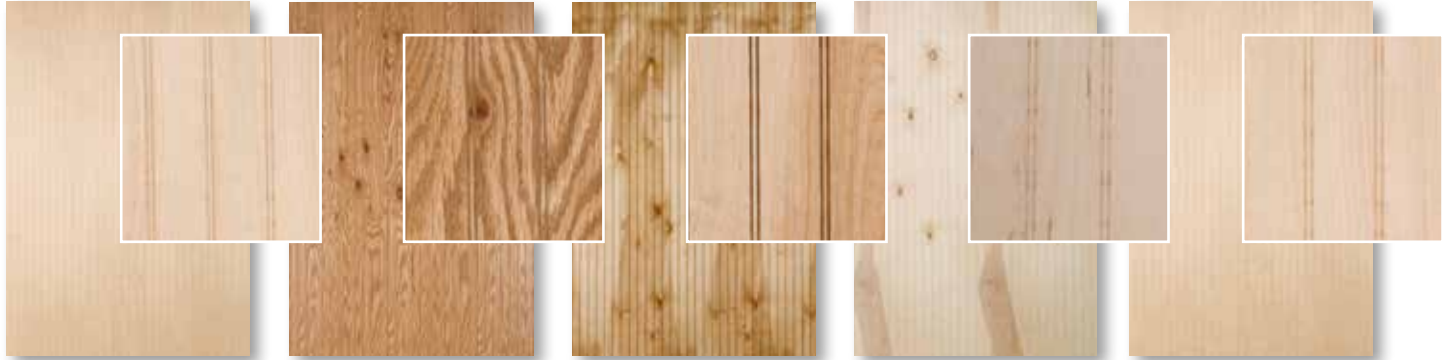
Unfinished White Birch 5/32" Beaded 1-1/2" OC

Murphy's most popular real wood veneer paneling features the classic look of bead board planks without the expense. The easy-to-install, 4 X 8 panels are perfect for wall paneling, wainscoting, cabinet doors and cabinet backers. The beads are 1-1/2" OC.