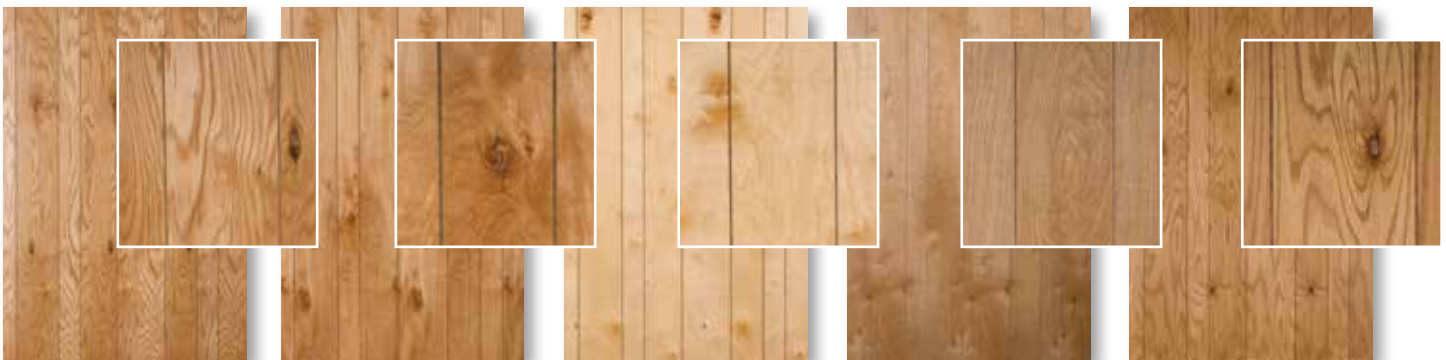
Brighton Oak 1/4" Orangeburg / V-Groove

Named after a local Oregon river, the McKenzie line features real wood with a V-Groove in the Orangeburg pattern listed below.