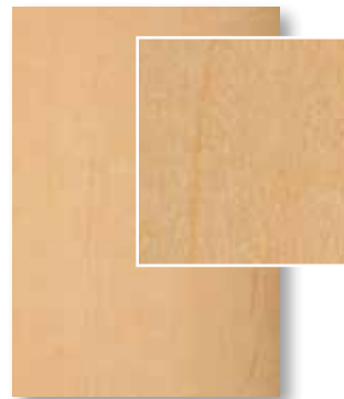
Honey Maple* 1/8" MDF substrate Paper Overlay