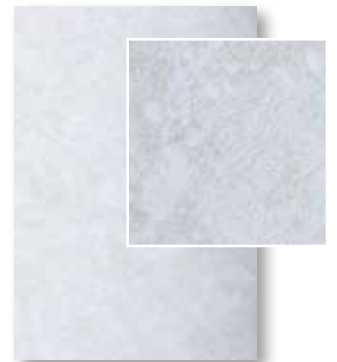
Summer Cloud* 1/8" MDF substrate Paper Overlay

Factory applied paper overlays offer an attractive, economical paneling option. Murphy uses various backing substrates that provide the look of real wood quality at a lower cost.