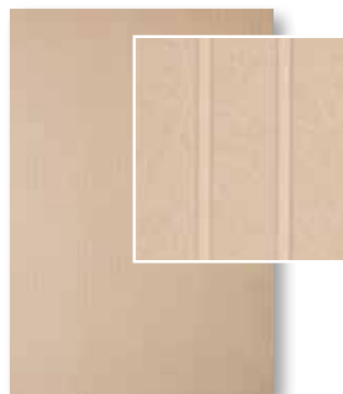
Unfinished 5.2mm MDF substrate