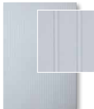
Primed 5.2mm MDF substrate

Murphy Premium Beaded MDF uses a proprietary bead and is available in the following sizes: