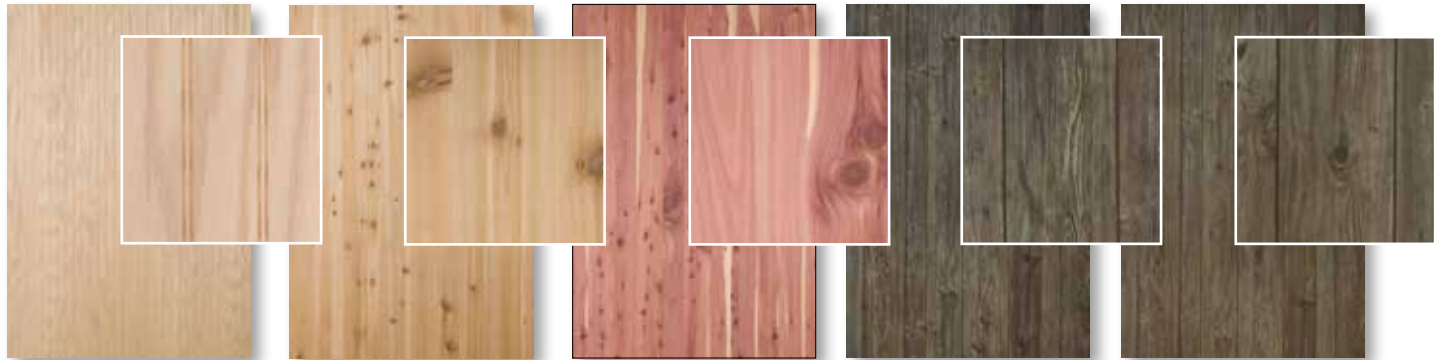
Oak Unfinished 5.0 mm Beaded 1-1/2" OC