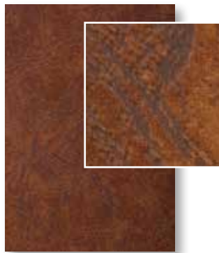
Coffee Bean Leather* 1/8" MDF substrate Paper Overlay