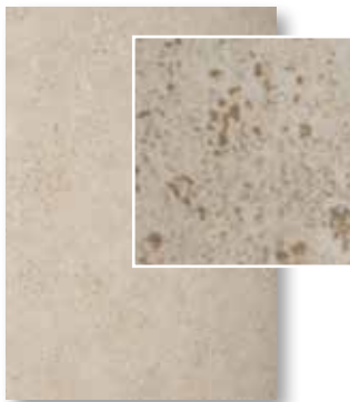
Beige Stone* 1/8" MDF substrate Paper Overlay